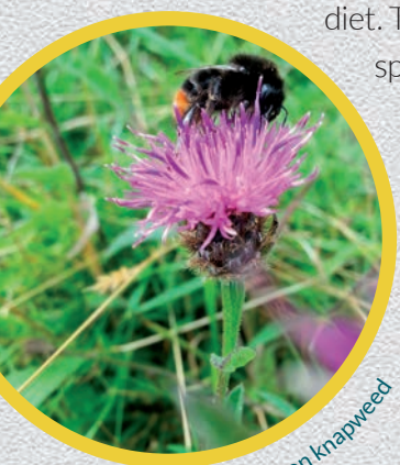
Red tailed bumblebee on knapweed

species are, what habitats they occur in and the best time of year to collect and use their seed. If you choose to collect seed from other plants you should make sure that they aren't on an endangered plant list.