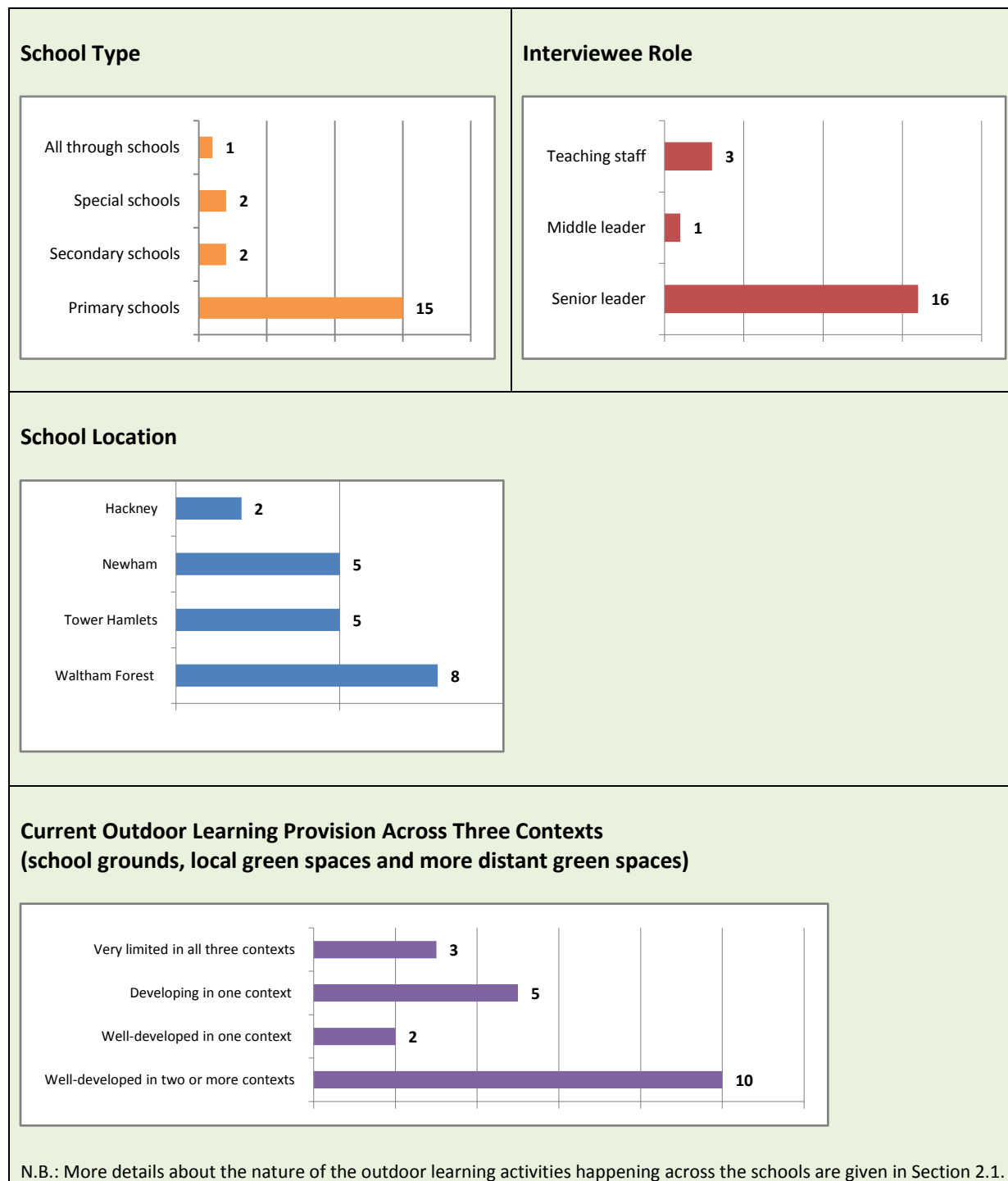
Figure 1.1 Characteristics of Participating Schools (n=20) and Staff Interviewees (n=20)