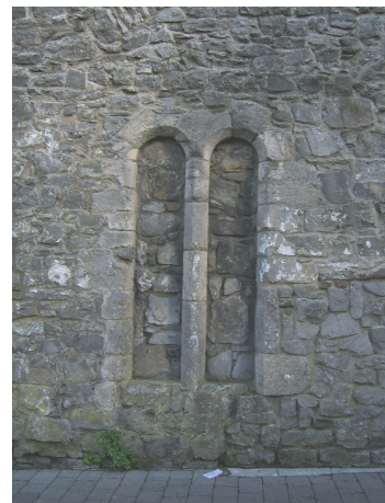
Window on north side of Kyteler's Inn

Find the window with the hood mould or dripstone and draw it in this box.